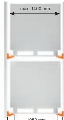
Pallet with load hangover