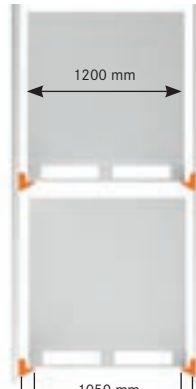
Pallet without load hangover